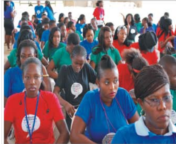
Students sparking in the their branded Google wears