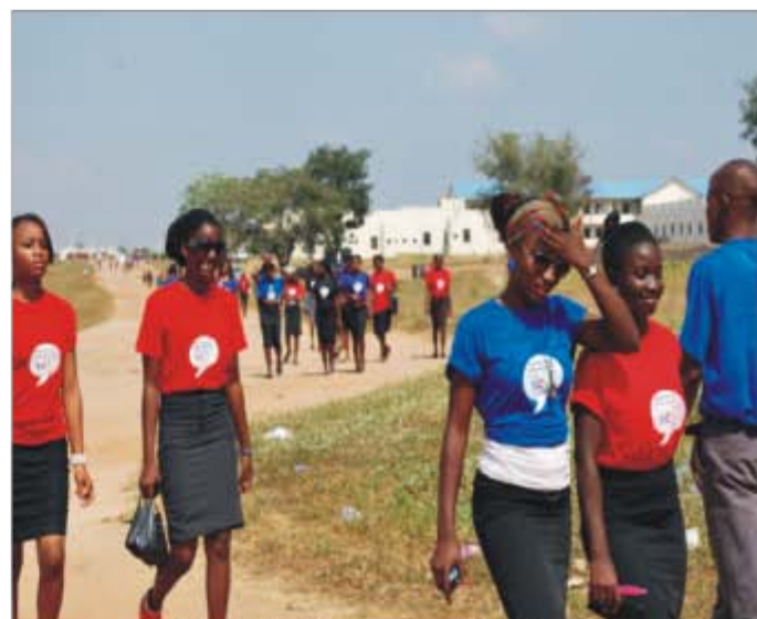
Colouring the campus Google