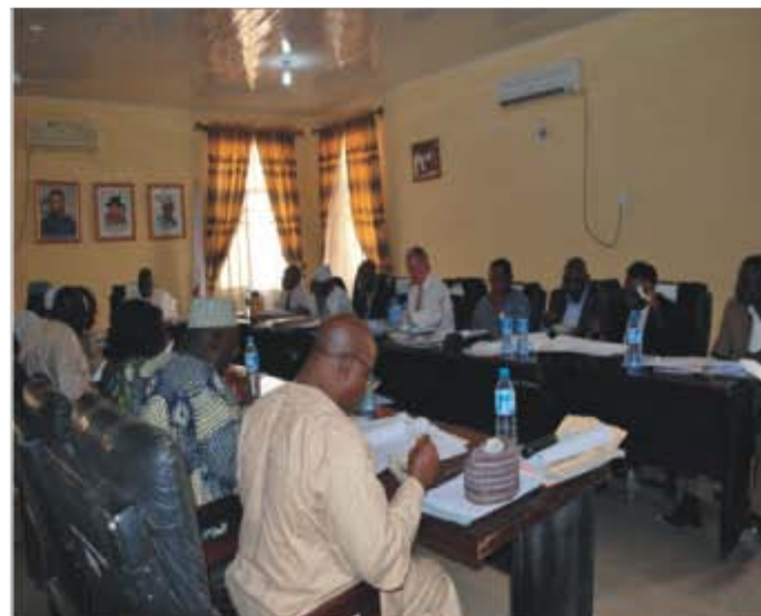
32nd Session of Bingham University Governing Council meeting held recently