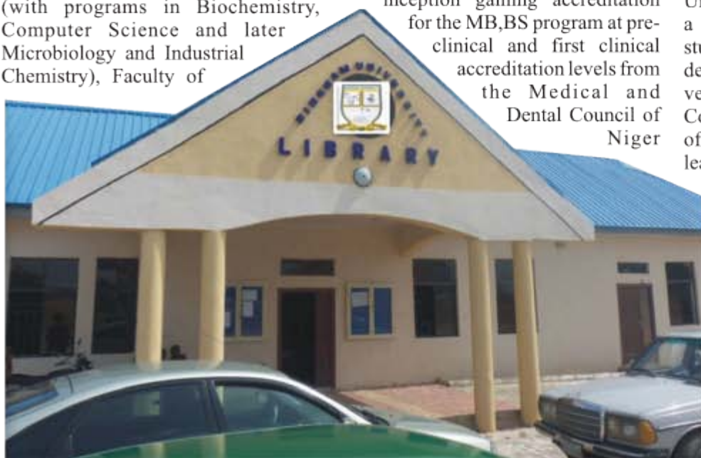
Bingham University Electronic Library

Bingham University Management is constantly working in collaboration with her partners and friends at home and