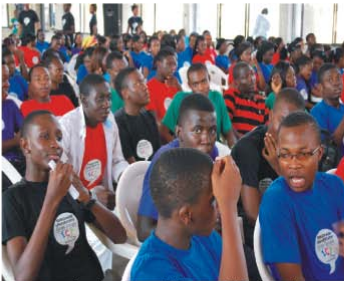
cross section of students enjoying a rendition from the stage