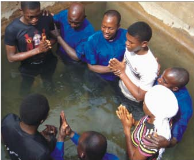
A group of baptismal students getting set for the spiritual renewal