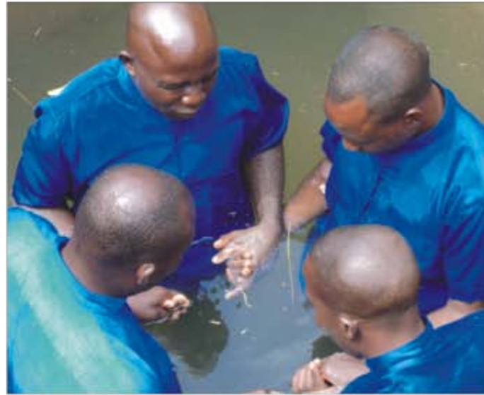
Officiating Clergies in a prayer session before the exercise