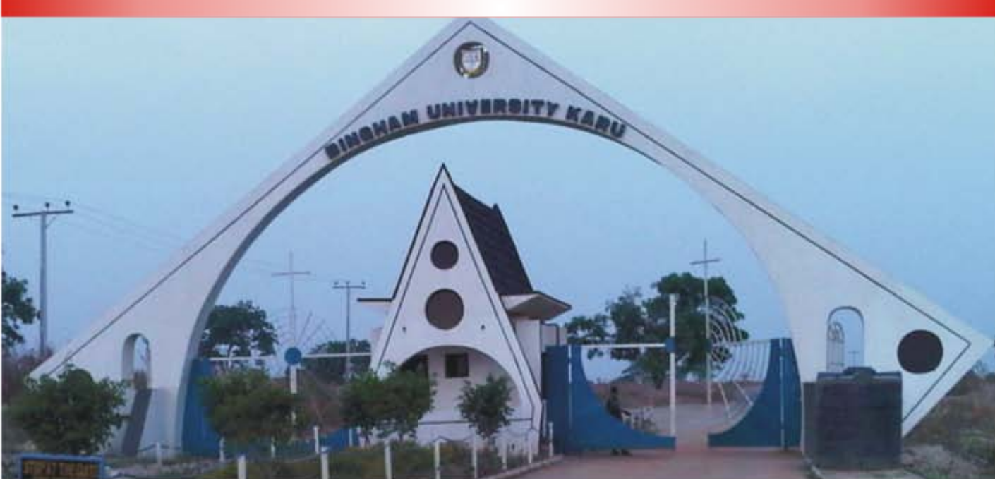
Main Entrance Gate of the Bingham University, Karu

divided into mentorship groups under dedicated staff to provide sound Christian mentoring.