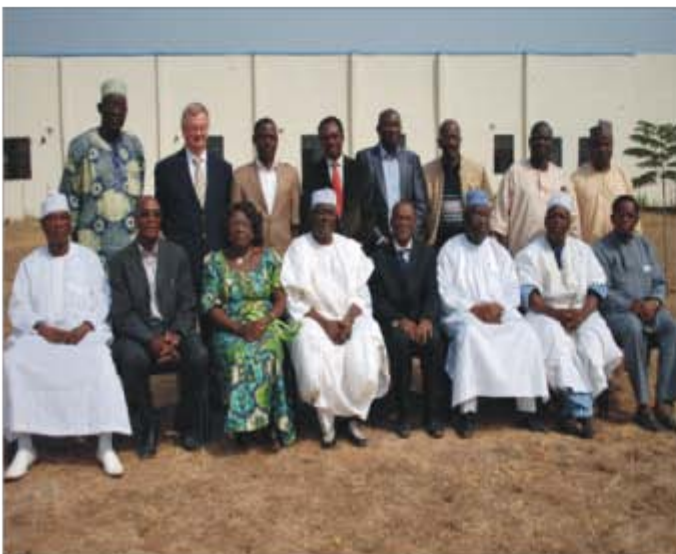
Members of the Bingham University Governing Council in a group photograph