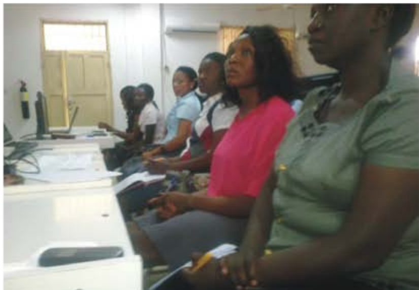
Cross section of Participants at the seminar

Highlight of the seminar was the presentation of certificate of attendance to participants and the deployment and redeployment of the secretaries to their offices of assignment.