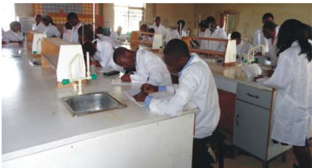
Science Micro Biology students undertaking a practical session in the Science and Technology Laboratory

The evolution of private Universities in Nigeria including Bingham University, Karu, has contributed immensely to the country's human capital development. The efforts of private Universities, especially Christian faith-based Universities in providing quality education in the face of over-whelming national challenges should attract the Federal and State Government support through the provision of grants from the Education Tax Fund to motivate private Universities to continue to complement government's human capital development efforts.