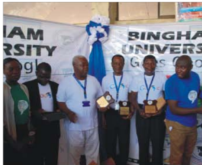
Awardees of the Google day displaying their awards