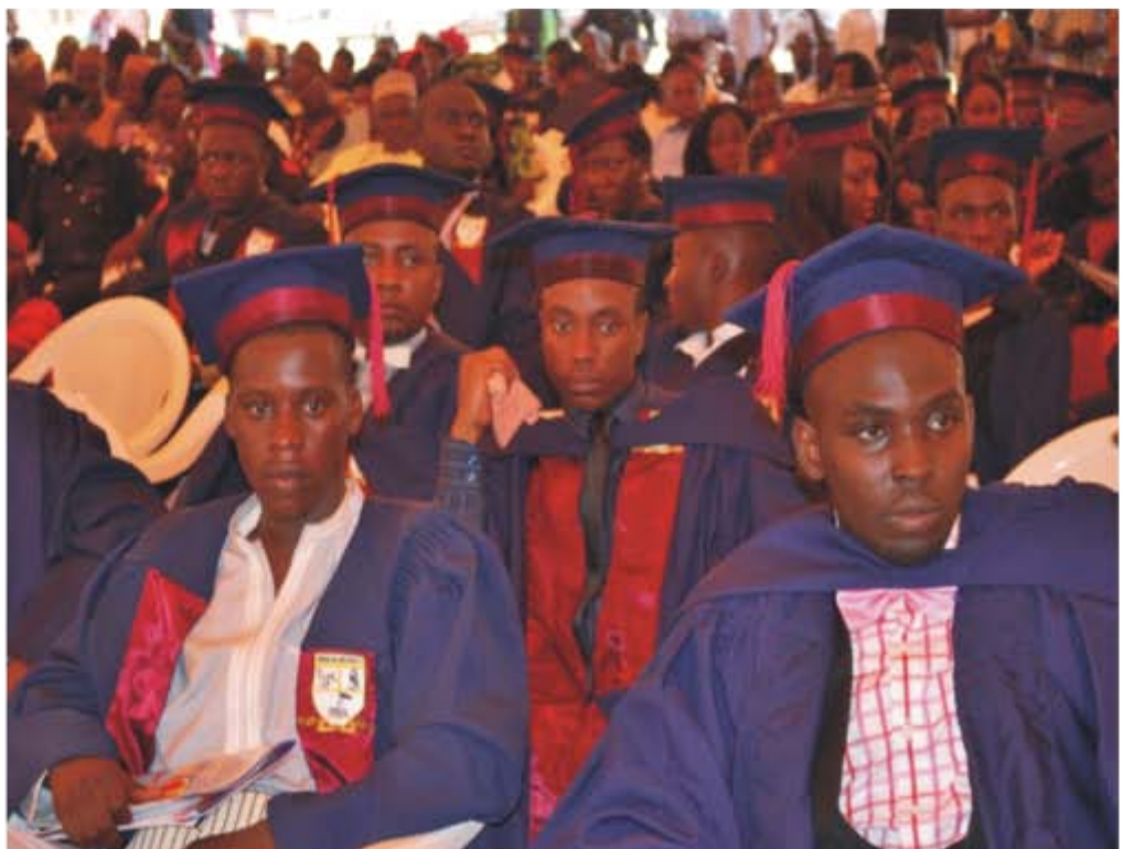
Graduating Students at the 2012 Convocation

Bingham University's goal is to produce total men and women equipped to affect their generation positively for Jesus Christ, serving humanity in ways that are glorifying to God and dignifying to humanity (Prov. 29:18). Our motto is, 'mission for