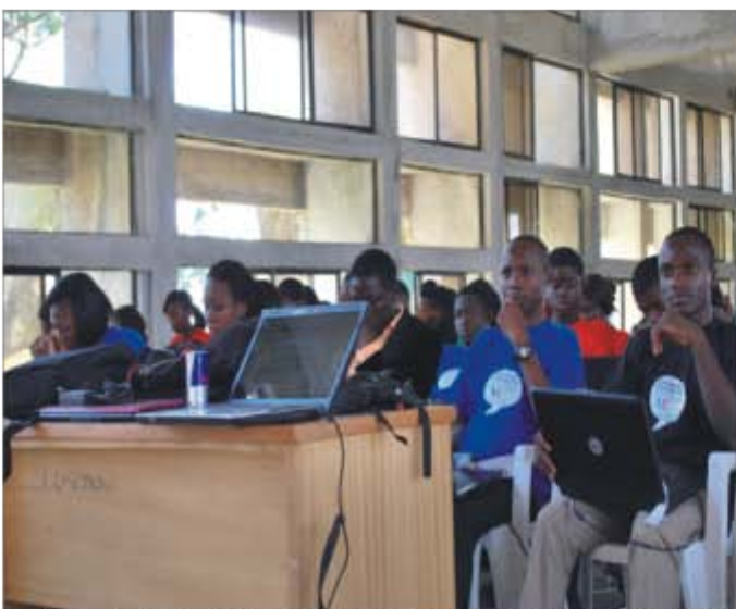
Mass Communication students doing a live coverage of the event on the Google