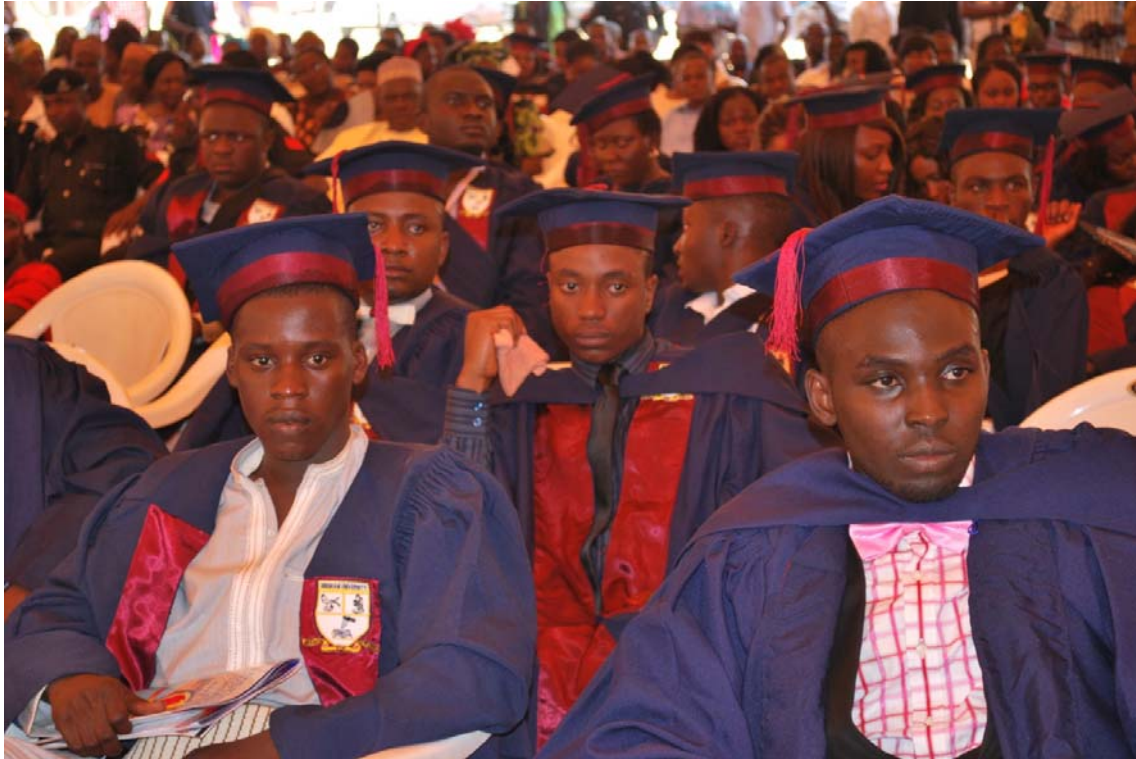
Graduating Students at the 2012 Convocation