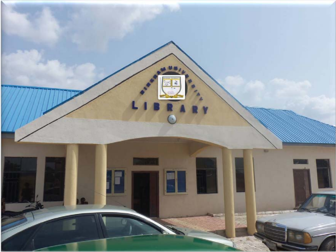
Bingham University Electronic Library