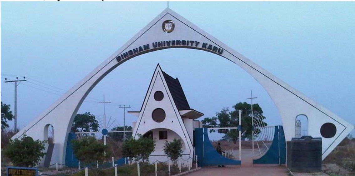
Main Entrance Gate of the Bingham University, Karu