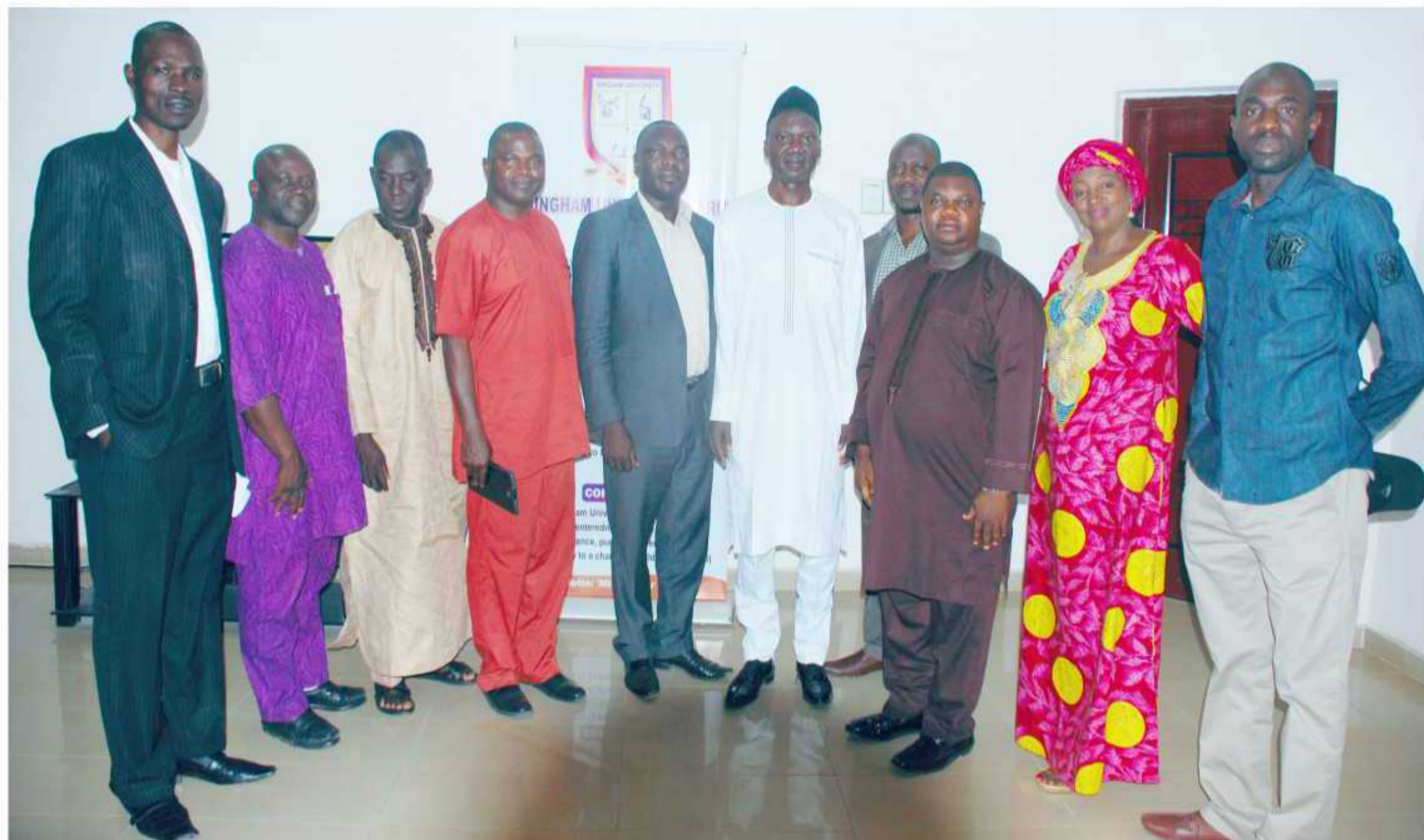
The Ag. Vice-Chancellor and members of his Management team with the Exco of GWAPLAZA

GWAPLAZA DCCs is a coalition of ECWA DCC's with membership drawn from Plateau, Kaduna, Nasarawa, FCT, Benue and Niger States.