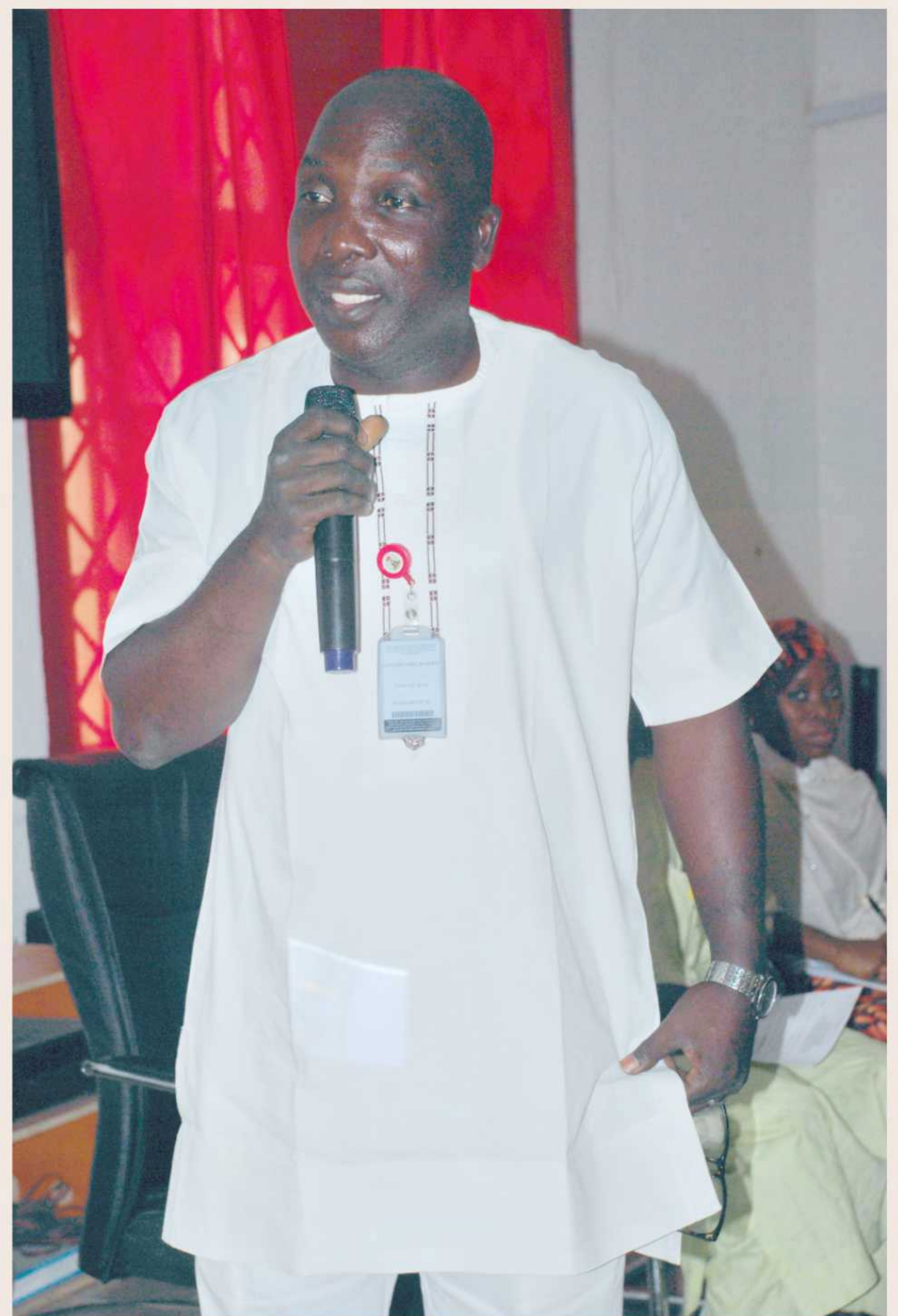
Area Manager, ITF making his presentation