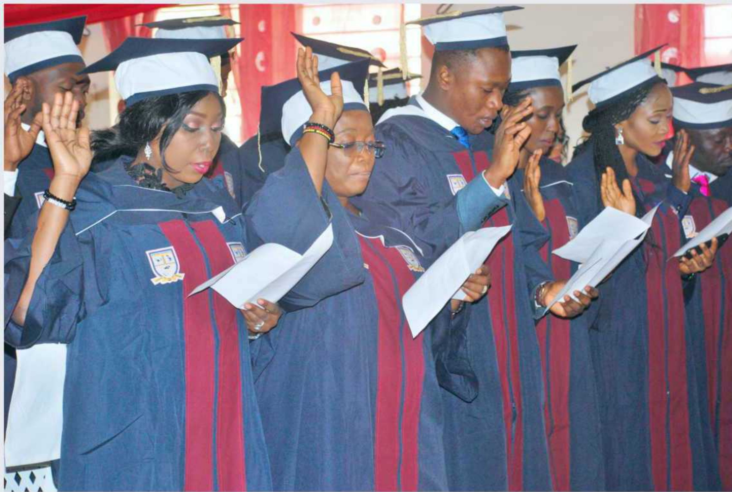
Graduating Doctors taking the Hippocratic Oath