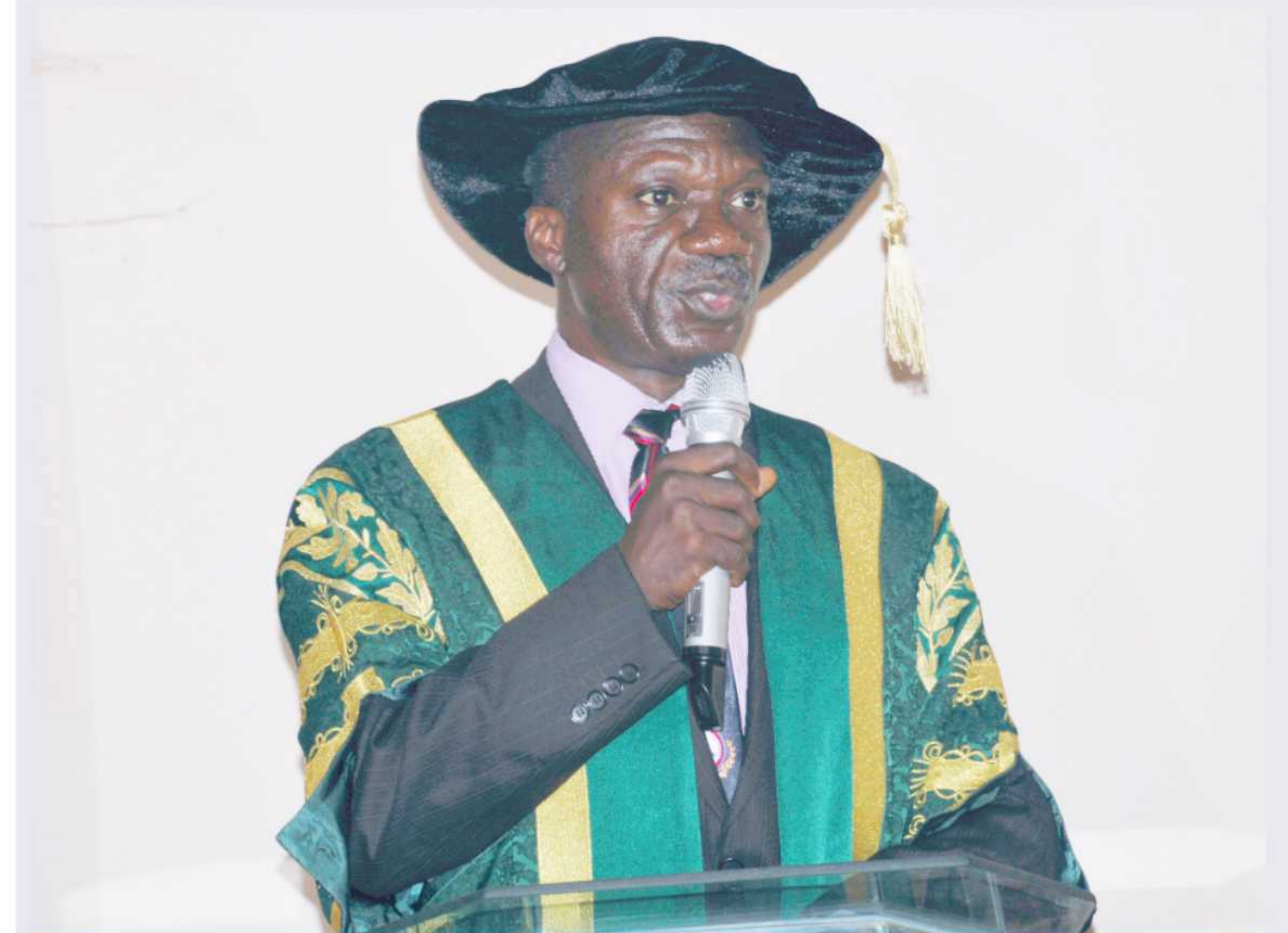
The Ag. Vice-Chancellor Speaking during the induction ceremony for the new Doctors