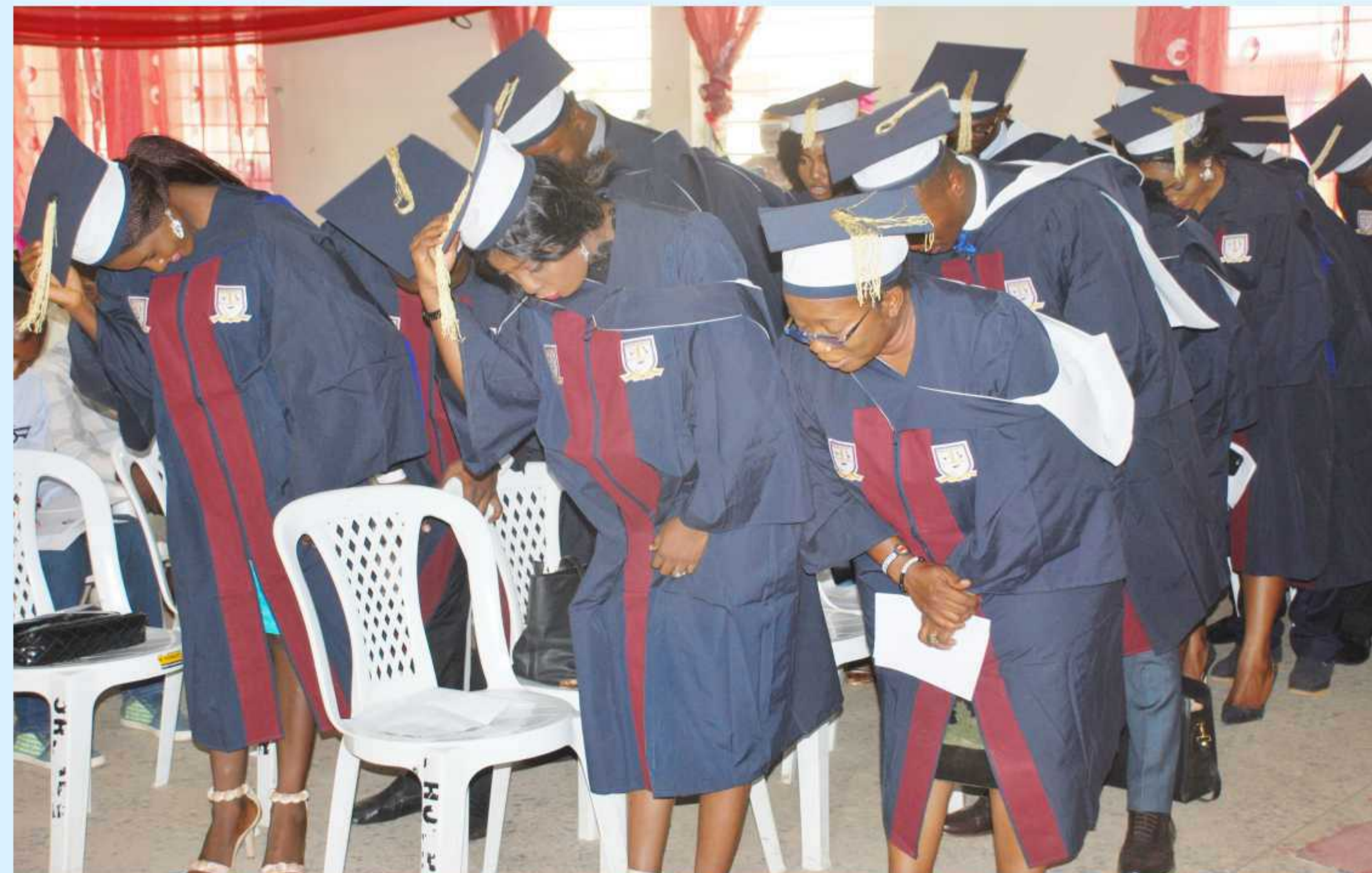
Inductees taking a bow at the Induction