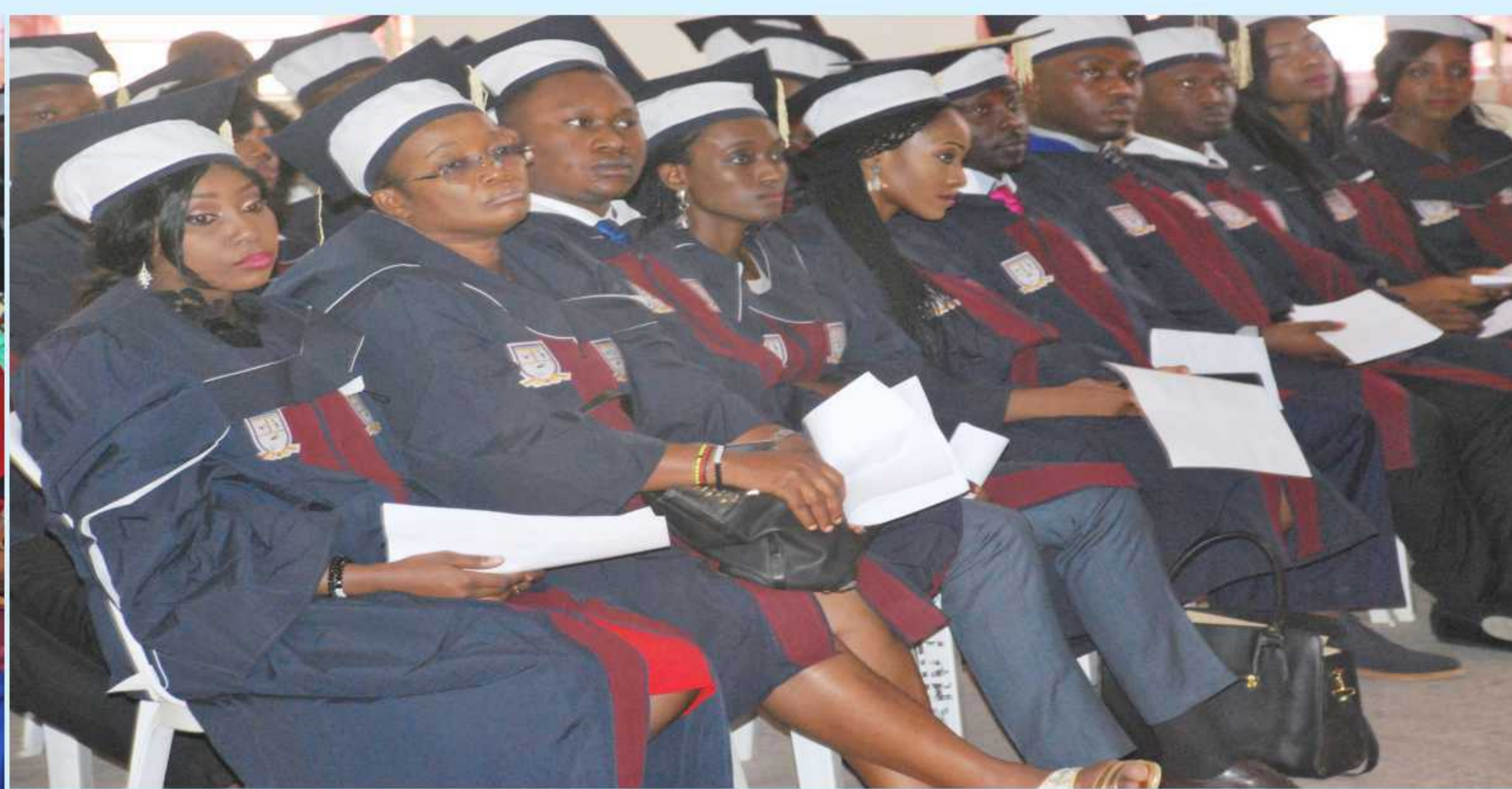
A cross section of Inductees at the Induction