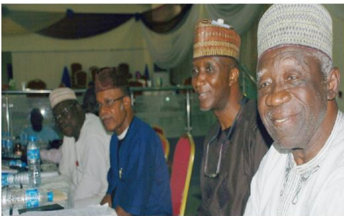
Rep. Chairman Board of Trustees and members of the BOT at the Retreat