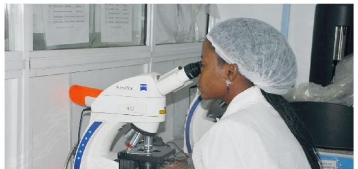
Microscopy lab with scientist reading slides