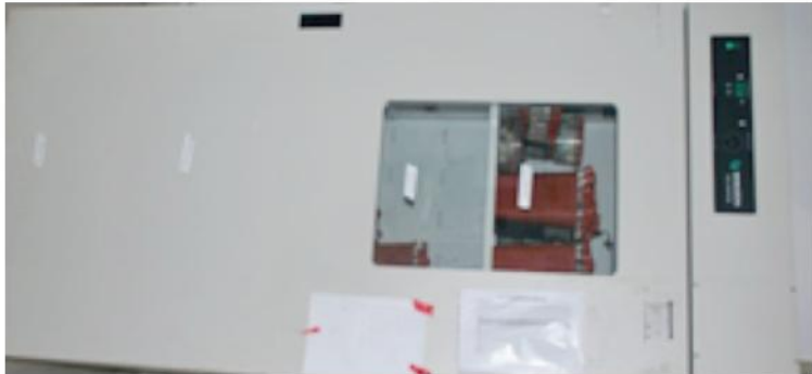
Wheaton incubator for Solid Culture