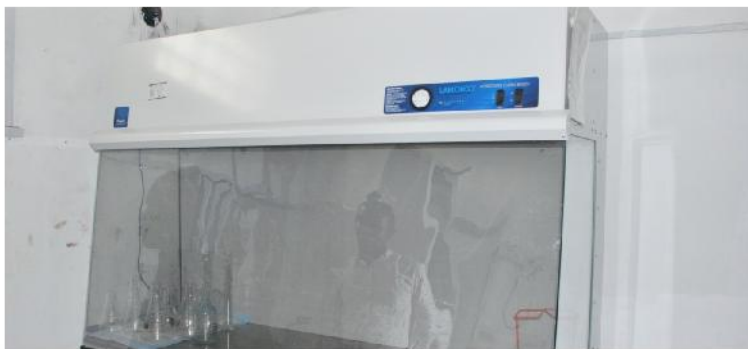
Lamina flow hood for media preparation