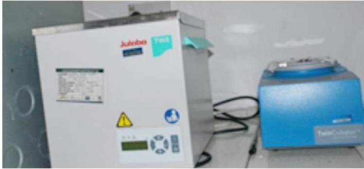
Twincubator for detection of DNA