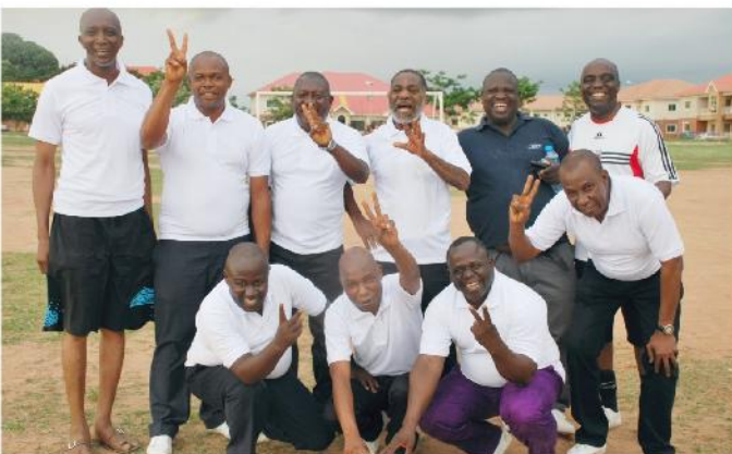
Team Governing Council and Board of Trustees in a Group Photograph