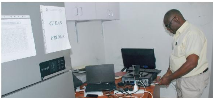
(LPA) Data room – Line probe Asssay