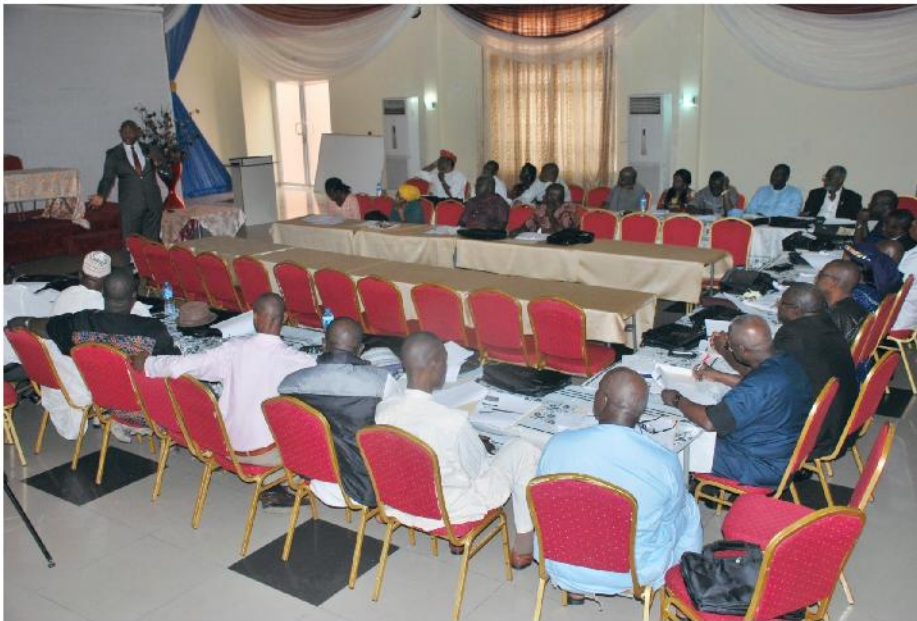
Retreat in session

Vice-Chancellor in managing the human, monetary and material resources of the university depended not only on his professional skills as an academic, but also on his ability to lead, motivate and inspire