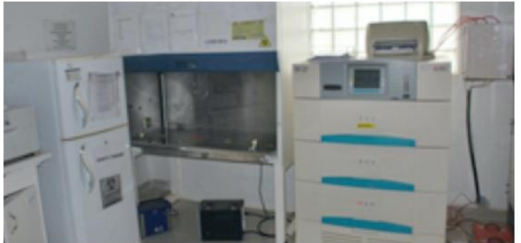
MGIT 960 for liquid culture and DST