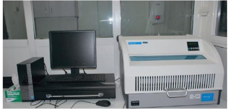
GT blot 48 and Genoscan for reverse hybridization