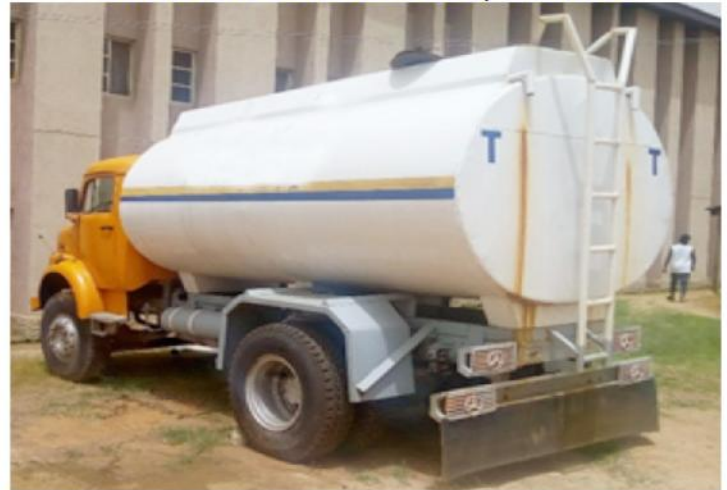
The acquired water tanker for College of Medicine and Health Sciences

Not resting on its oars, the management of Bingham University has again acquired a new water tanker for the college of Health Sciences, Jos campus, to complement the boreholes for water supply to the students' hostel and college buildings.