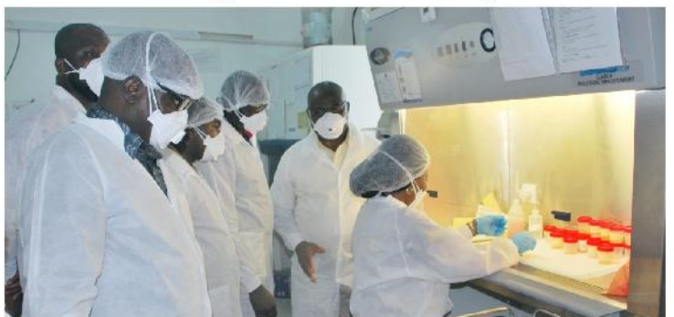
Training session for genexpert and microscopy sites In Nasarawa State in Biosafety class II plus laboratory