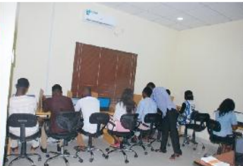
E-library for Political Science Department