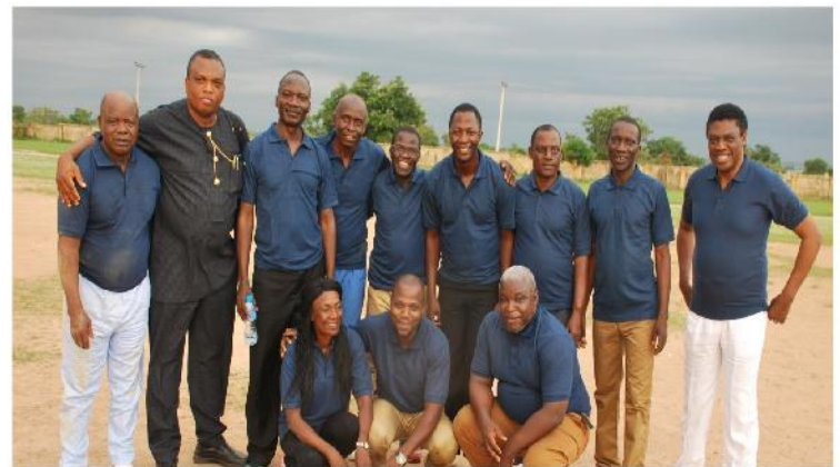
Team Management Committee in a Group Photograph