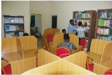
Political Science Departmental Library

In its bid to improve facilities and make the university conducive for learning, the management of Bingham University has renovated the departmental library for the department of Political Science. The management has also set up a new e-library for the department.