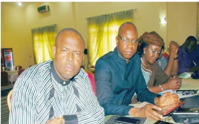
Members of the Governing Council during the Retreat