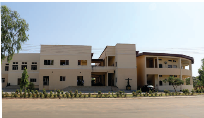
Faculty of Law