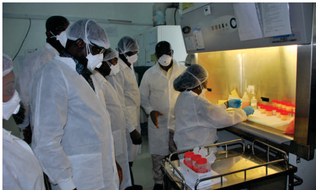
Advanced Research Laboratory procedure at Zankli Research Centre of Bingham University