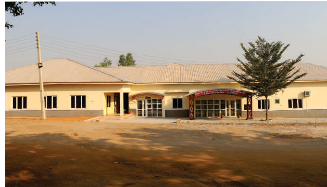
Center for Innovation, Entrepreneurship and Leadership Studies