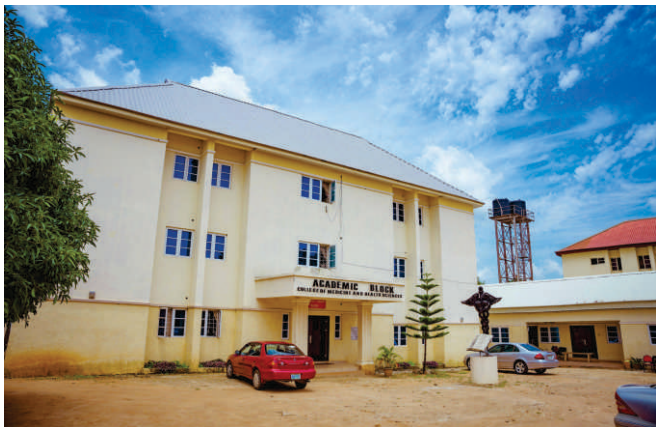
College of Medicine and Allied Health Sciences (Academic Building) Jos Campus