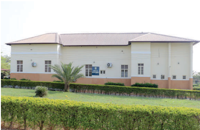
Faculty of Science and Technology