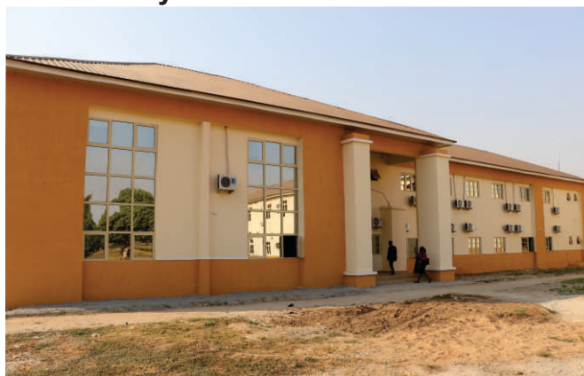
Faculty of Allied Health Sciences