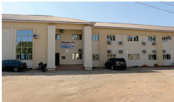
Faculty of Basic Medical Sciences