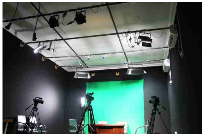
Mass Communication Studio