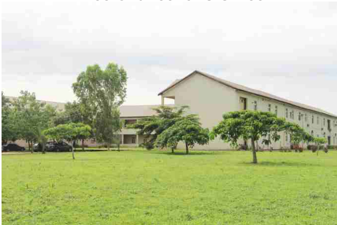
College of Medicine and Allied Health Sciences Karu Campus