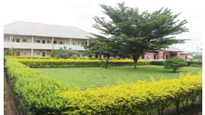
School of Postgraduate Studies