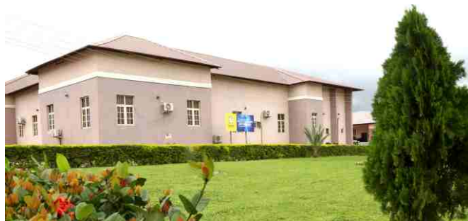
Faculty of Science and Technology