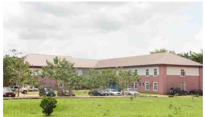
Faculty of Health Sciences

All information in this pamphlet was correct at the time of print. Bingham University reserves the right to amend any information therein.