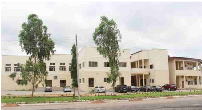
Faculty of Law