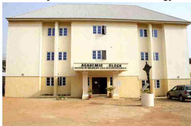
College of Medicine and Allied Health Sciences (Academic Building) Jos Campus