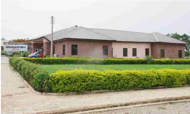
Vice Chancellor's Office